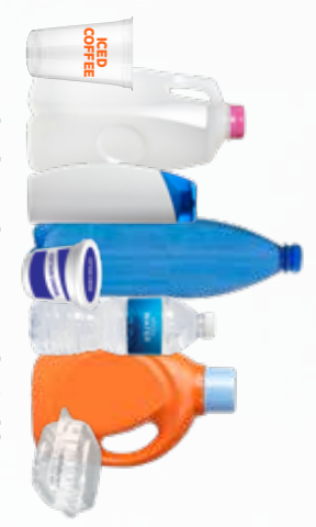
Plastic Bottles, Jugs, Tubs & Lids (Empty kitchen, laundry, & bath containers & clamshells)