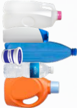
Plastic Bottles, Jugs, Tub, & Lids (Empty kitchen, laundry, & bath containers)