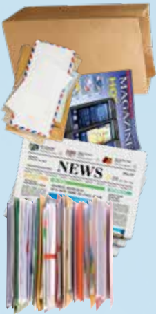
Junk Mail, Periodicals, & Office Paper (Paper bags, envelopes, & catalogs)