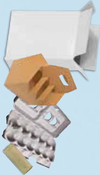
Boxboard (Dry-food boxes, egg cartons, & rolls)