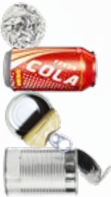
Aluminum & Steel Cans (Foil & empty food & beverage cans)