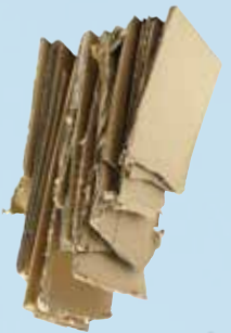
Corrugated Cardboard (Wavy center layer)